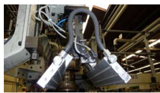
GRM4 unit installed on Battenfeld® equipment.