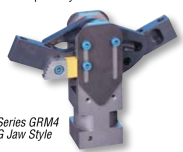
Series GRM4 G Jaw Style

NOTE: Solution may differ according to equipment design. Please check compatibility.